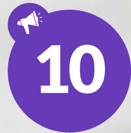
Sales and Marketing