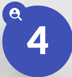
Finance and HR